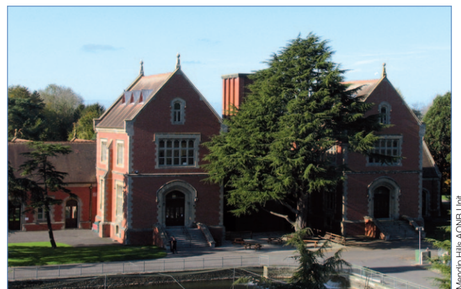
Mendip Hills AONB Unit